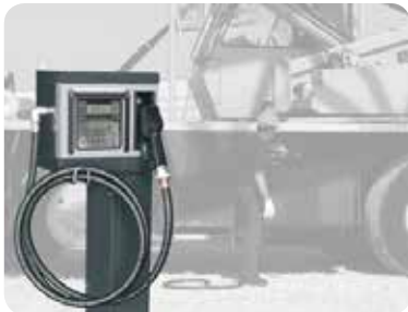
Available PRESET VERSION