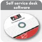
Self service desk software