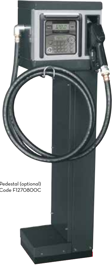
Pedestal (optional) Code F1270800C