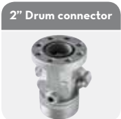
2" Drum connector