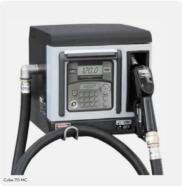
Cube 70 MC