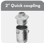
2" Quick coupling